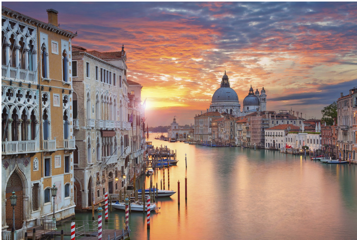
QUEEN OF THE ADRIATIC VENICE