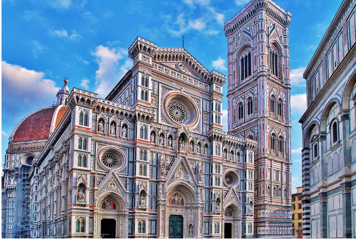
SANTA MARIA DEL FIORE FLORENCE